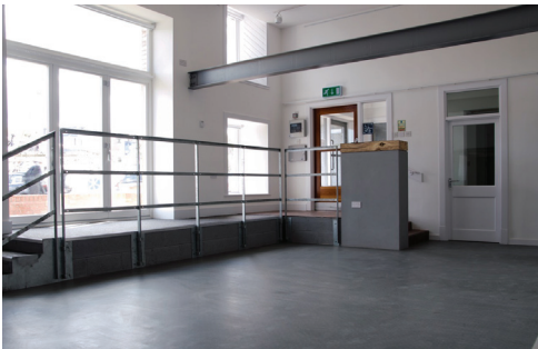
View facing stage area (staging removed)

The Hippodrome is a multi-use arts space for exhibitions, music, theatre, poetry, film and creative and community events in the picturesque fishing town of Eyemouth.