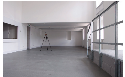
View facing north