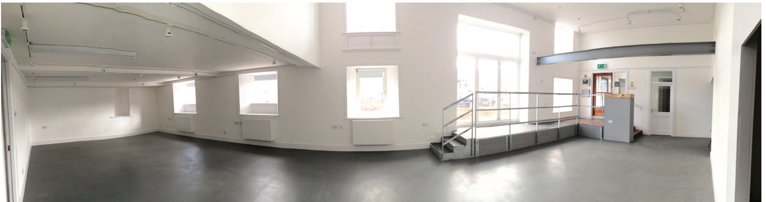
Panoramic view facing harbour

For information contact space@eyemouthhippodrome.org t: 01890 750099 m: 0759 569 1895