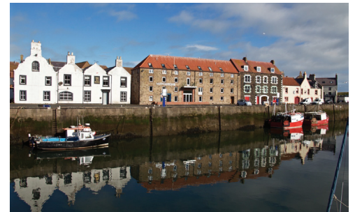
The Hippodrome: on the harbour

The Hippodrome is a multi-use arts space for exhibitions, music, theatre, poetry, film and creative and community events in the picturesque fishing town of Eyemouth.