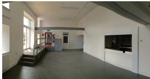
View facing south